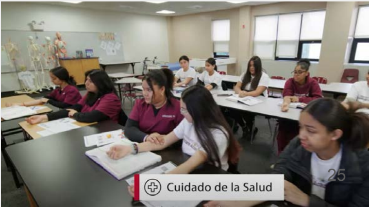
Cuidado de la Salud