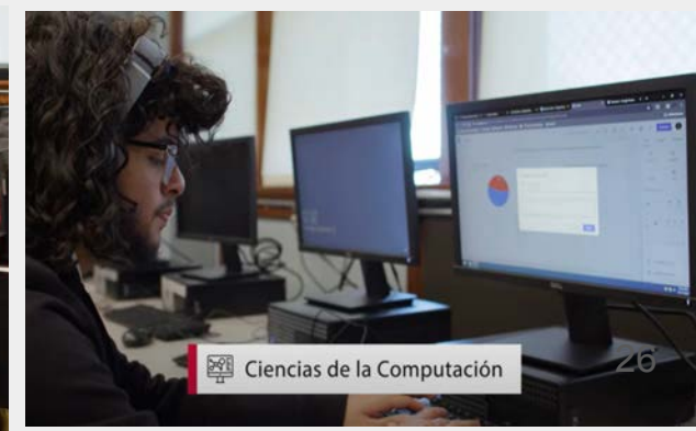
Ciencias de la Computación