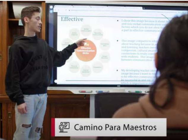
Camino Para Maestros