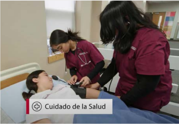
Cuidado de la Salud