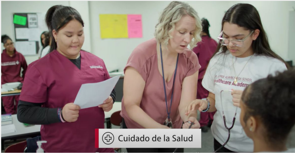
Cuidado de la Salud